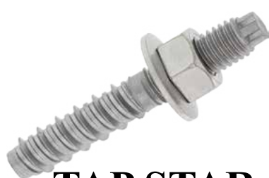
TAP STAR (TAP STARII)

Product No.: U0-00/03-J0TP (U0-00/03-J4TP) Features: Easy and reliable installation by anyone with an impact driver. Improves work efficiency!