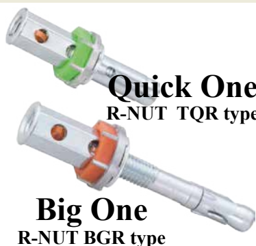
Quick One R-NUT TQR type

Product No.: U0-00-R06A, U0-00/02-R06Q Features: Allows checking of tightening torque and bolt insertion in one go. Improves workability and work quality. Handling sizes: W3/8~W1/2 Main Usages: Installation of various types of suspensions (electrical, piping, air-conditioning ducts, etc.)